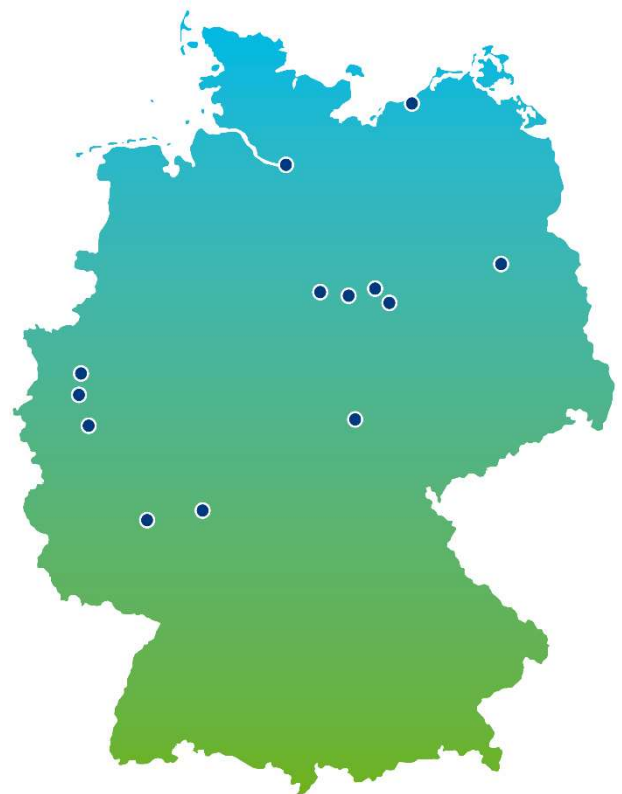
Locations PKF Fasselt Schlage